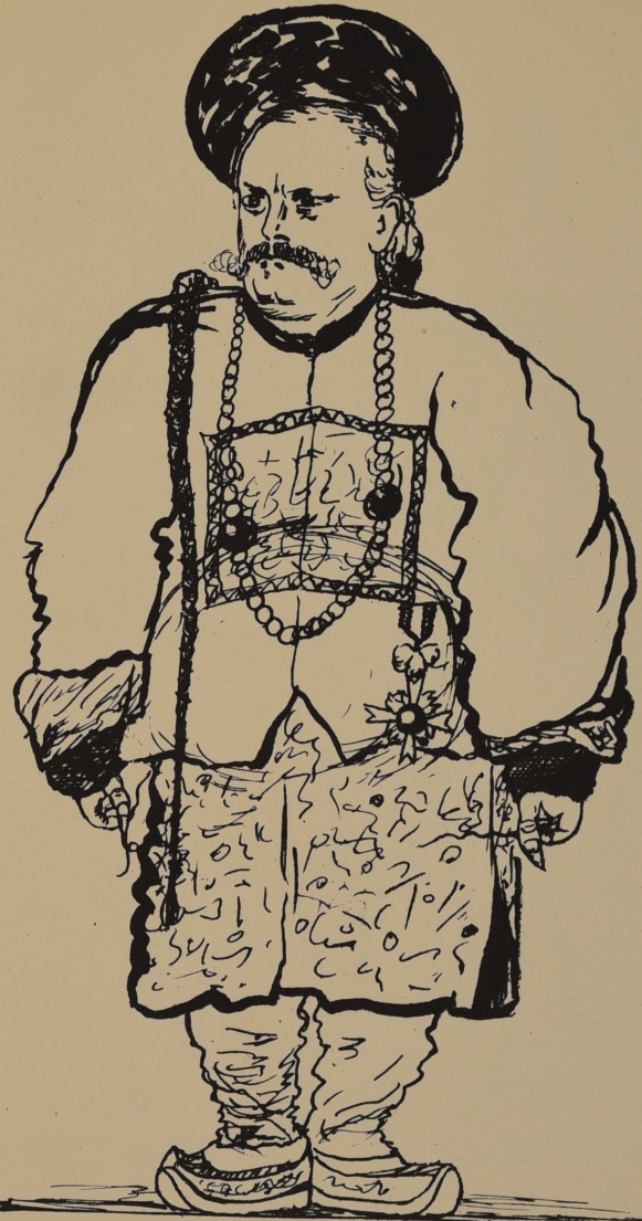
— HEZ KALLEE YOW-SEE — (He belong belly Big Mand'lin)