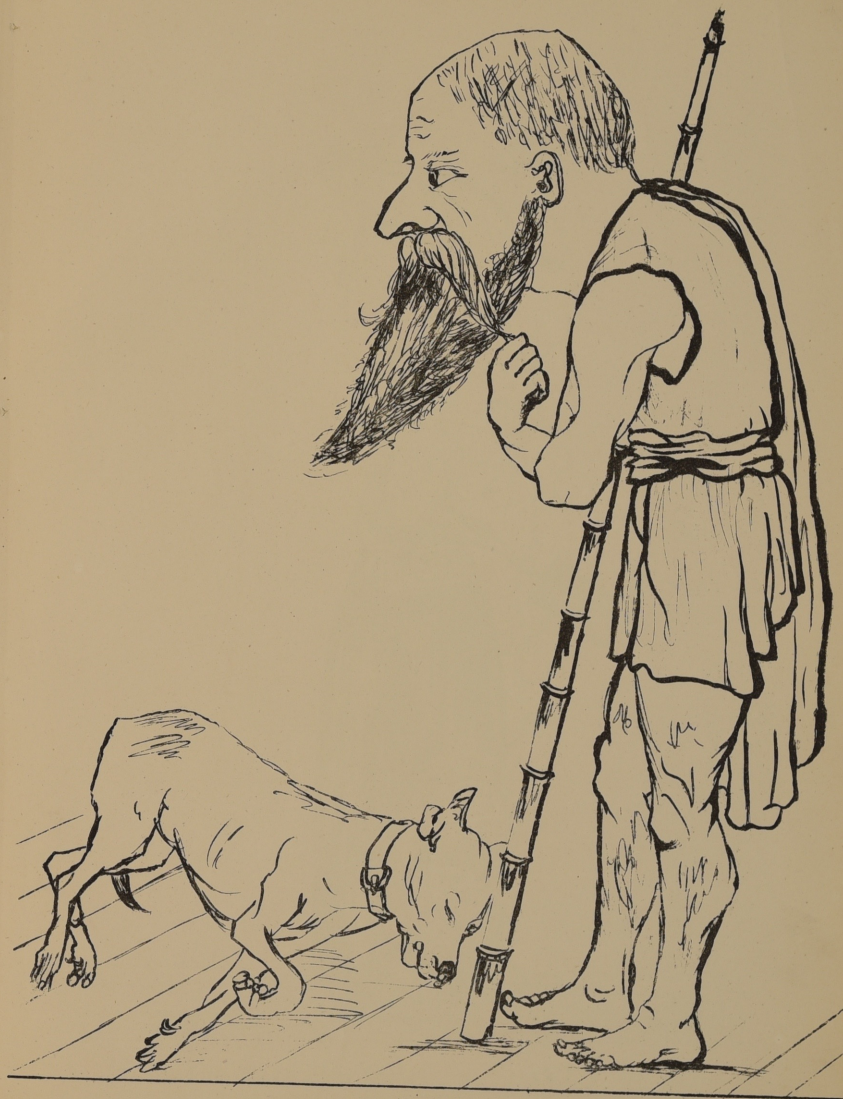
— Unser Ulysses und sein Hund —