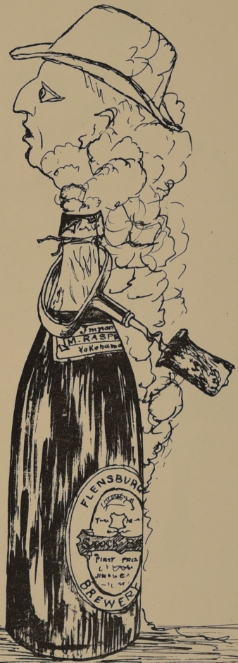
— The Sole Jim Porter as BACCHUS — (A Stock joke from the International Exhibition)