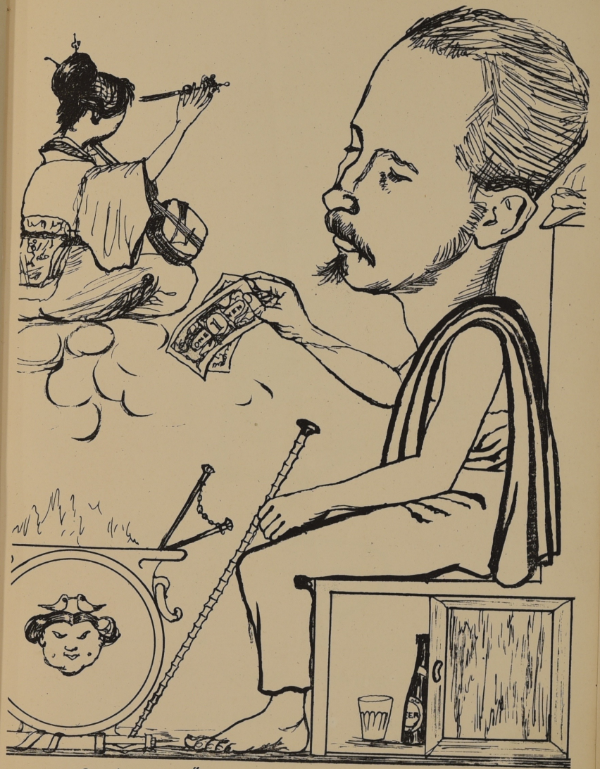
Our Artist as "Homer Invoking the Muse"